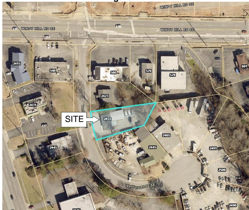
Figure – 1