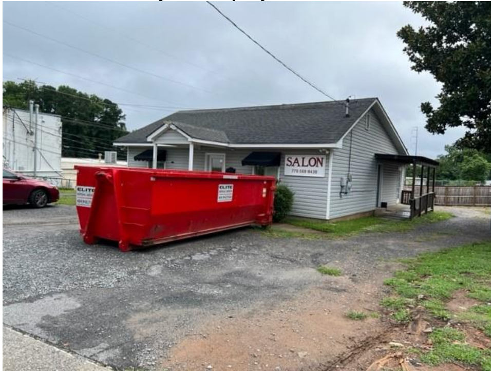
Figure – 7 Adjacent Property across Ventura Place