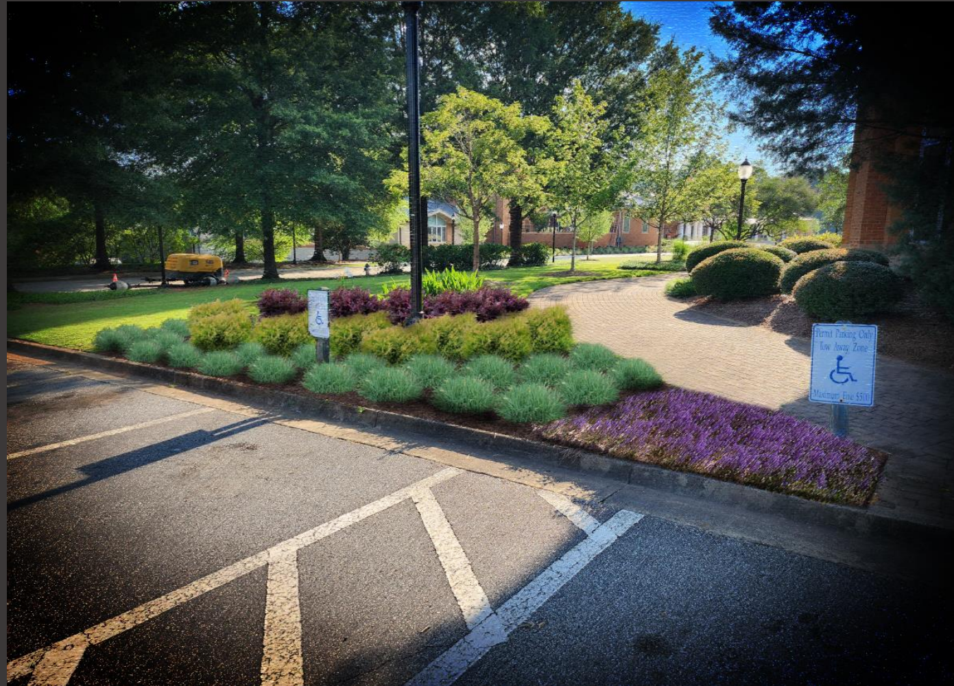
Update planting bed adjacent to parking lot with plant material matching that of the foundation.