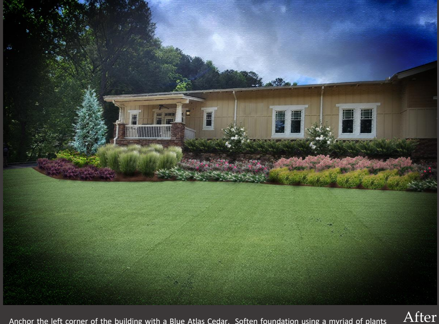
Anchor the left corner of the building with a Blue Atlas Cedar. Soften foundation using a myriad of plants including Beautyberry, Loropetalum, Switch Grass, Camellias, Butterfly Bush, Arborvitaes and Hydrangeas. Decrease the size of the planting bed with Bermuda sod.