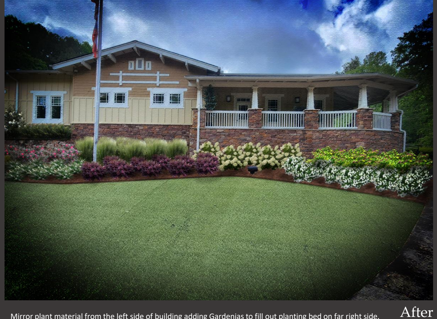
Mirror plant material from the left side of building adding Gardenias to fill out planting bed on far right side.