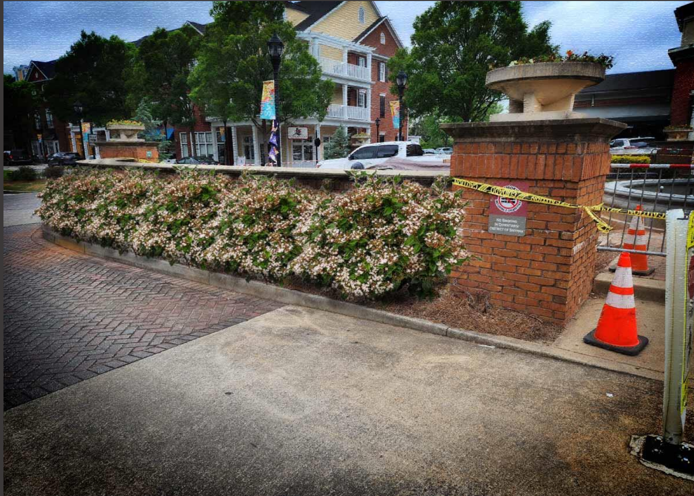
Add Spring Bouquet Viburnum on the outside walls providing year round color and seasonal flowering.