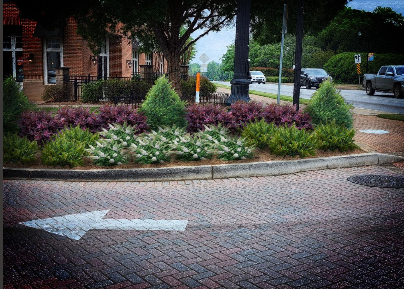
Matching the Market Village Sign – Boxwood, Loropetalum, Butterfly Bush and Distylium – greet each vehicle as it arrives onto the site.