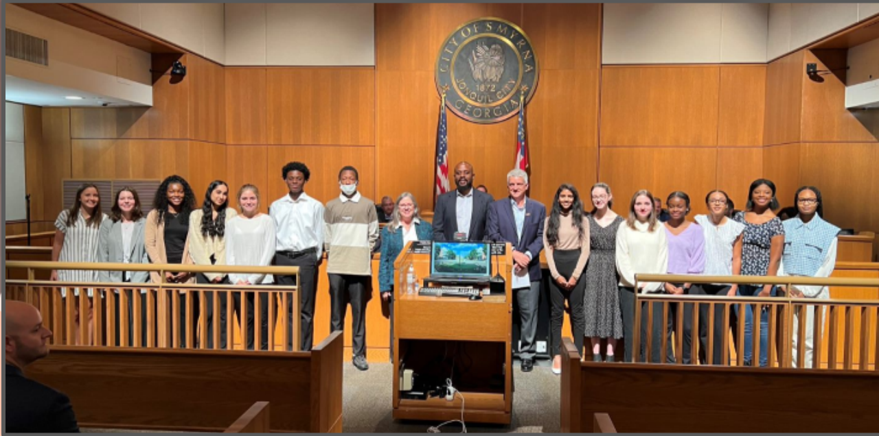
Smyrna Youth Council