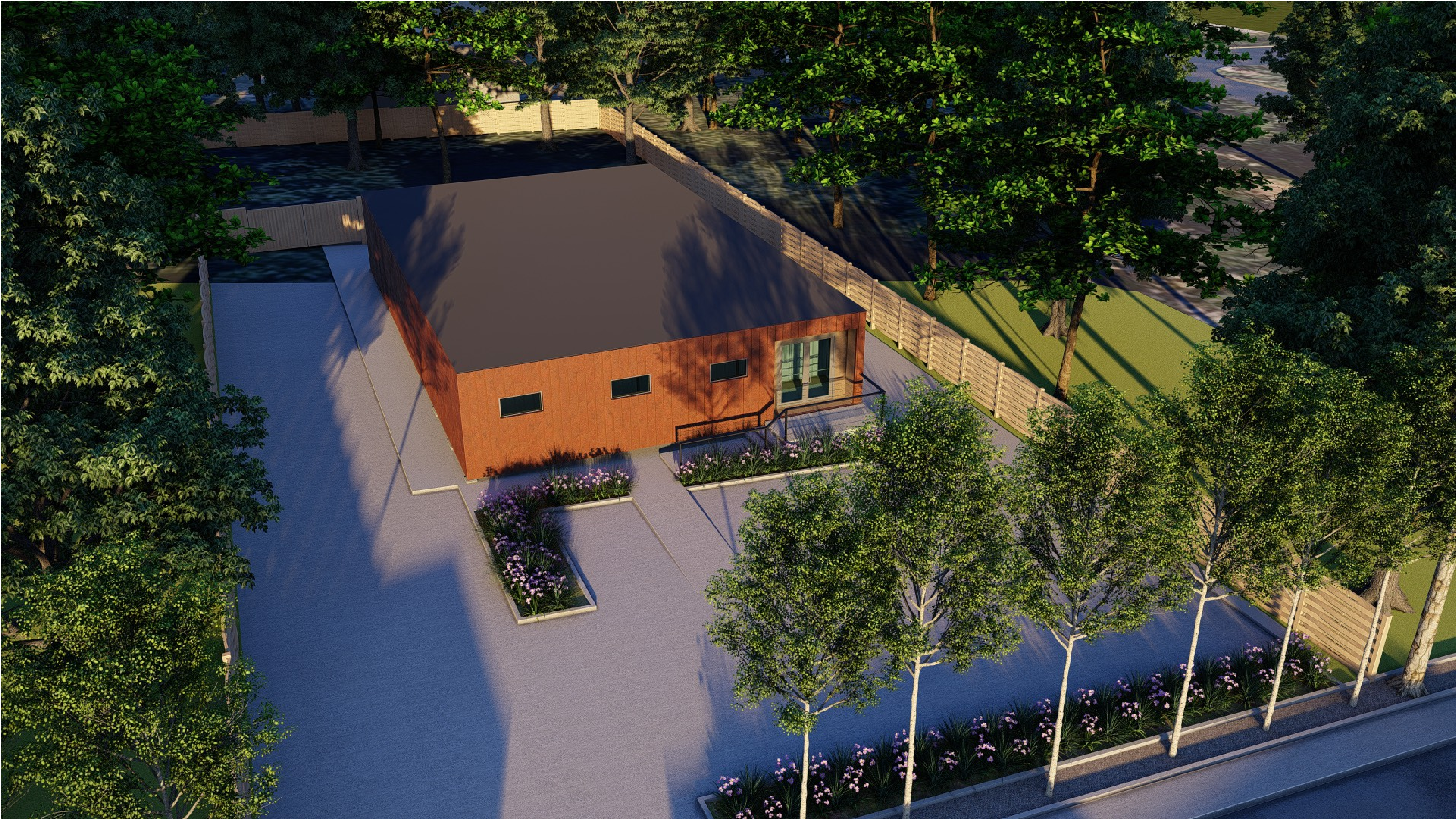
2 WEST ELEVATION 3/8" = 1'-0"

2560 GSF OFFICE BUILDING CLAD WITH CORTEN STEEL WALL PANELS, RUBBER ROOF SYSTEM, ALUMINUM INSULATED GLAZING