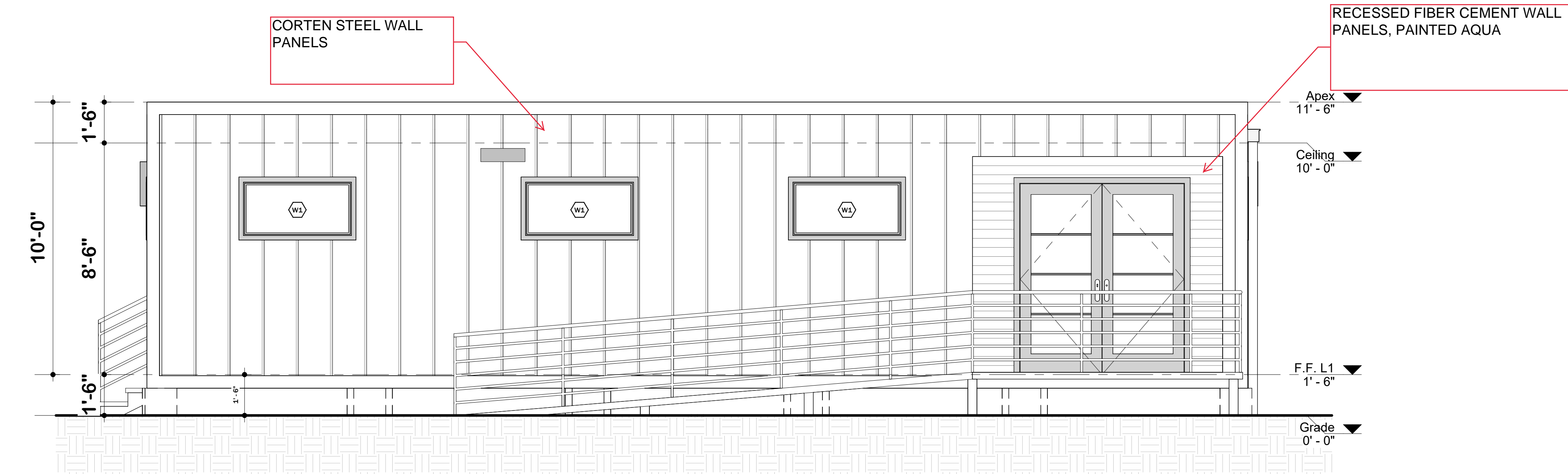
2 WEST ELEVATION 3/8" = 1'-0"