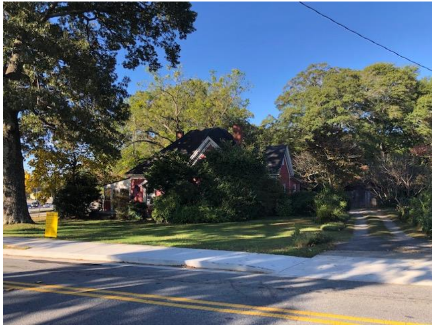
Figure 2 – Adjacent Property