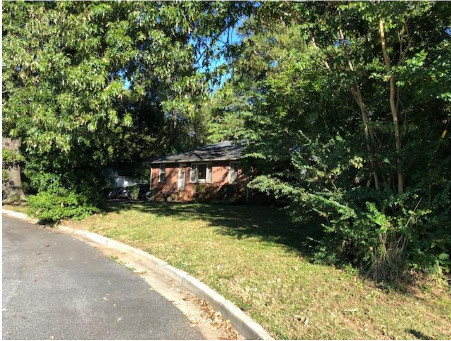
Figure 4 – Adjacent Property