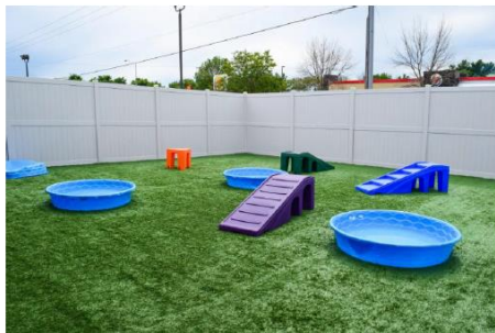
Interior look & feel: