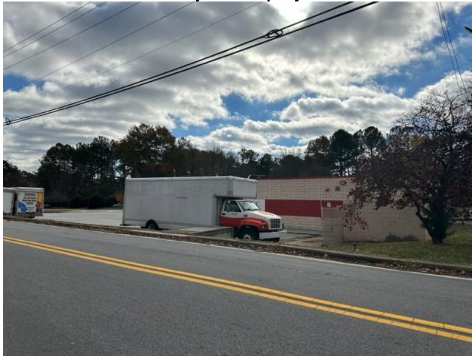
Figure – 8 Proposed Outdoor Area

Dogtopia outdoor areas are clean and aesthetically pleasing