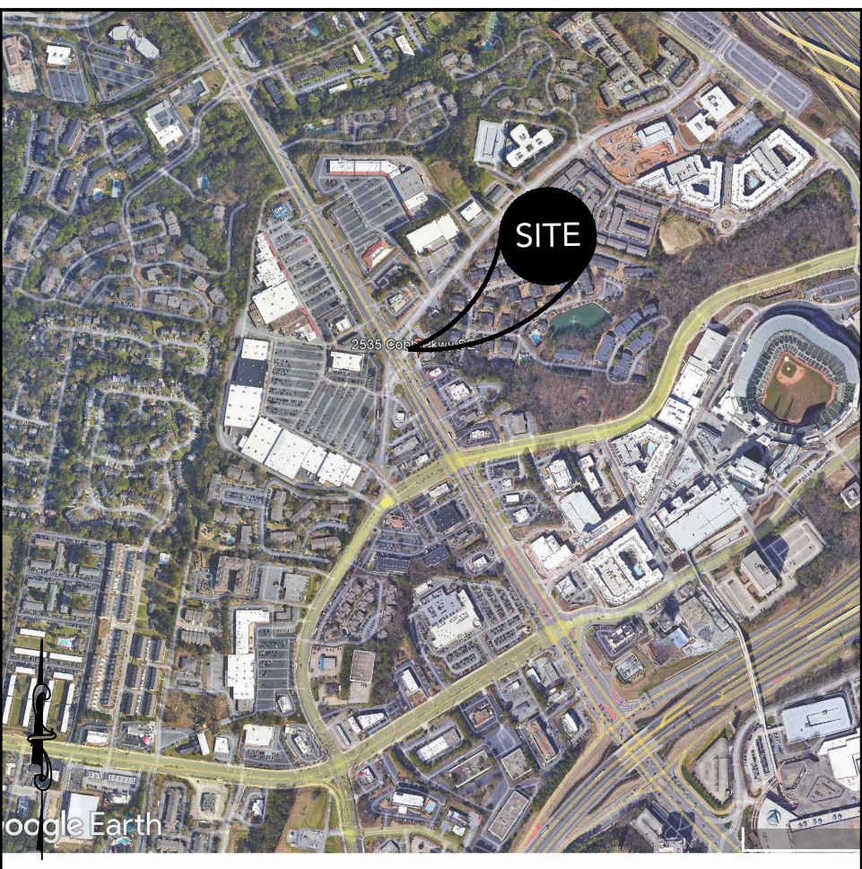
LOCATION MAP SCALE: N.T.S.