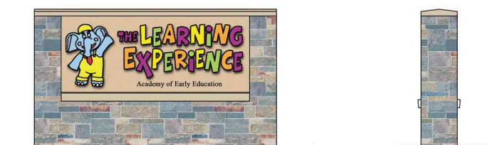
MONUMENT SIGN ELEVATIONS SCALE 1/8 = 1'-0"