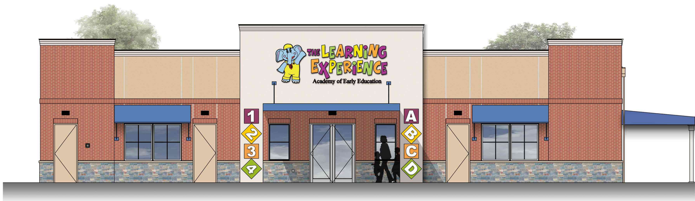
SOUTH ELEVATION SCALE 1/8 = 1'-0"