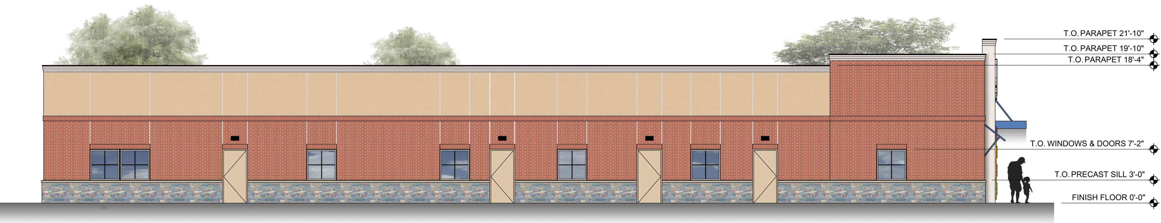
WEST ELEVATION SCALE 1/8 = 1'-0"