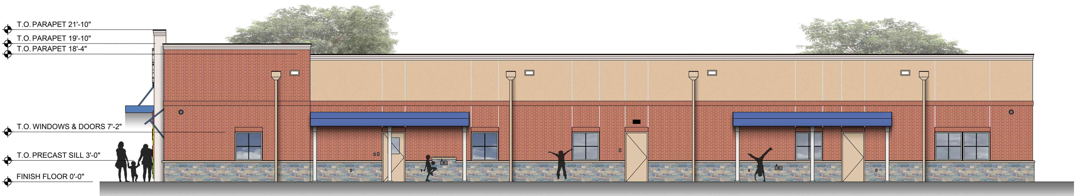
EAST ELEVATION SCALE 1/8 = 1'-0"