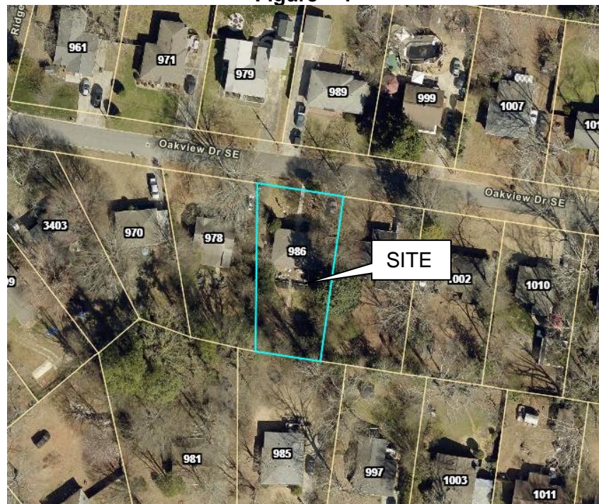
Figure – 1