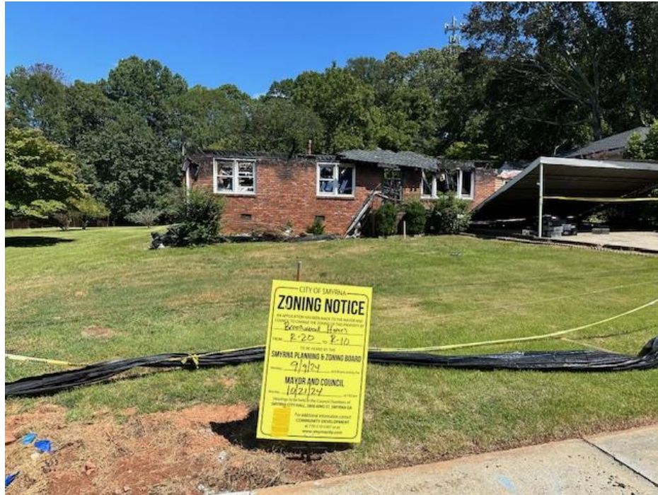
Figure 2 – Subject Property