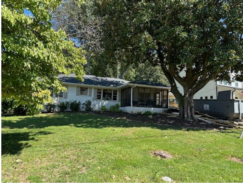
Figure 4 – Adjacent Property