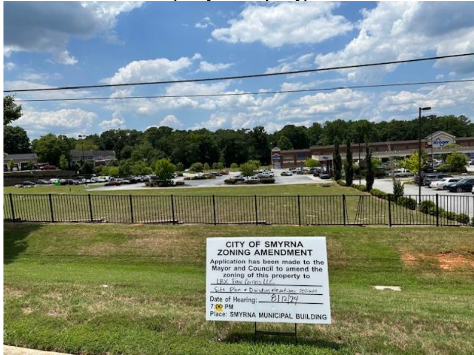
Figure – 1 (Subject Property)

Community Development does not support the requested zoning amendment to change the currently approved plan for the proposed daycare facility. Therefore, Community Development recommends denial of the requested zoning amendment.