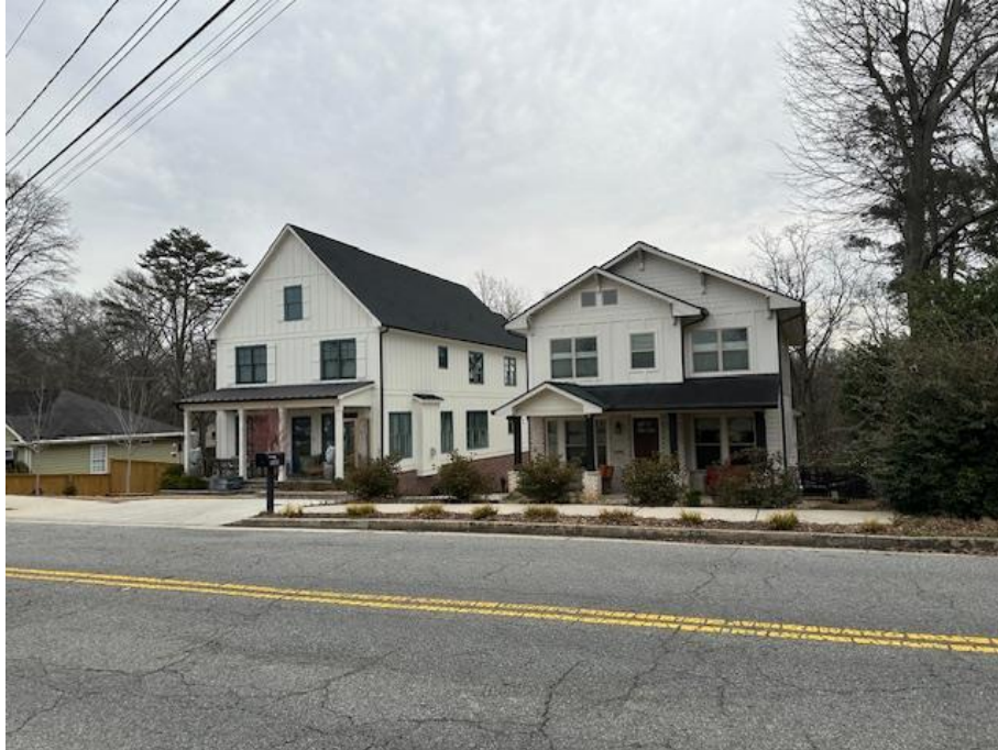
Figure 4 – Adjacent Property