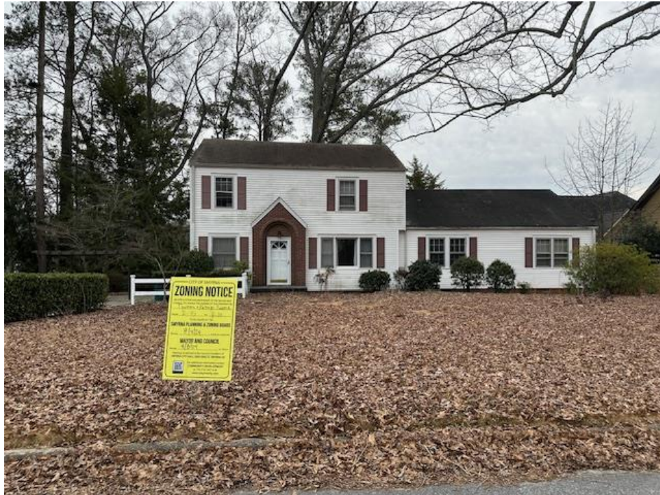
Figure 2 – Subject Property