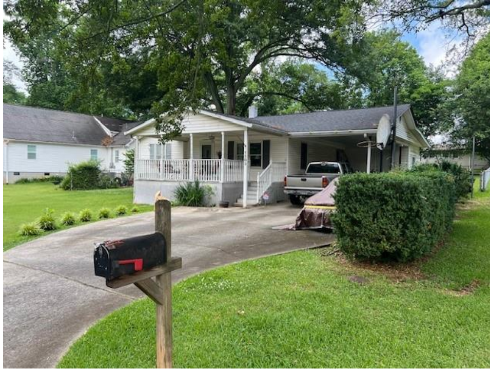
Figure - 7 Adjacent Property across Dell Avenue