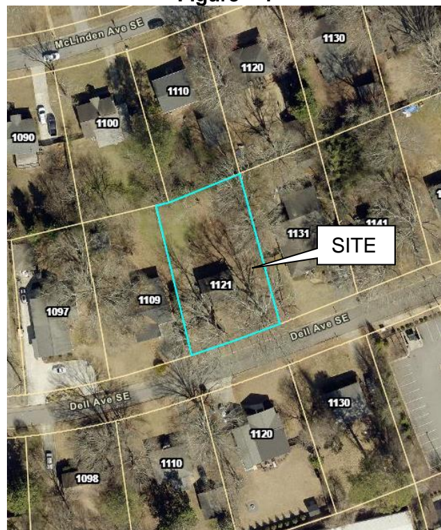
Figure – 1