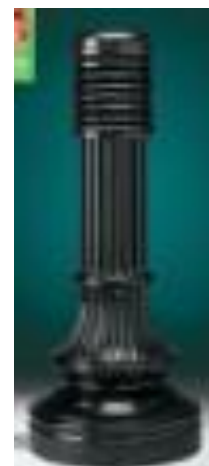
Post Top, Pendant, Bollard Fixtures

There is a minimum 1 month contract period for the lighting. At the end of the initial 1 month period the lighting contract is month to month with no change in pricing. The proposal is valid for 30 days from the above date. Any