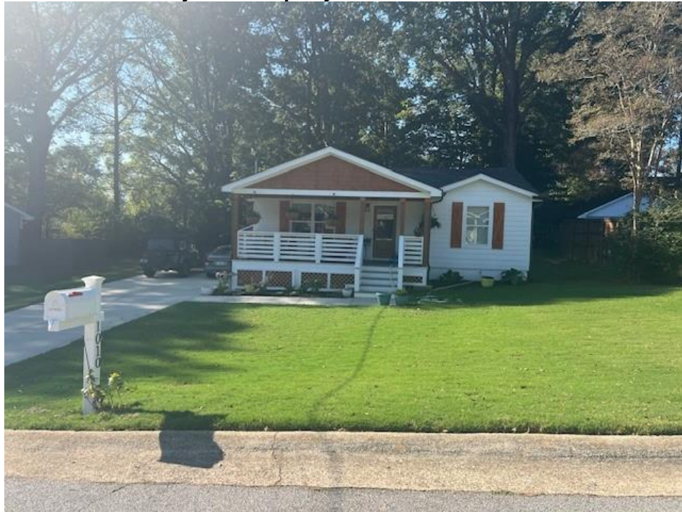
Figure – 7 Adjacent Property across Manor Drive