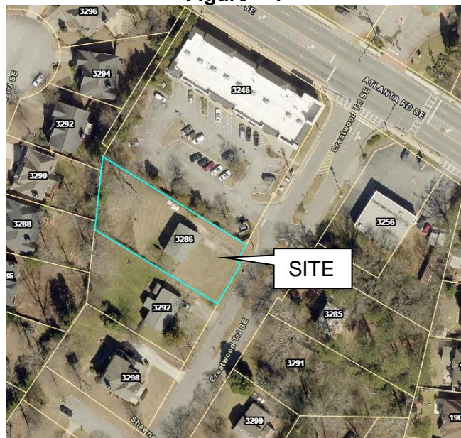
Figure – 1