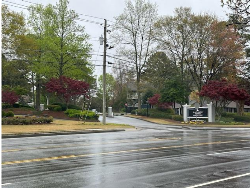
Figure 5 – Adjacent Property