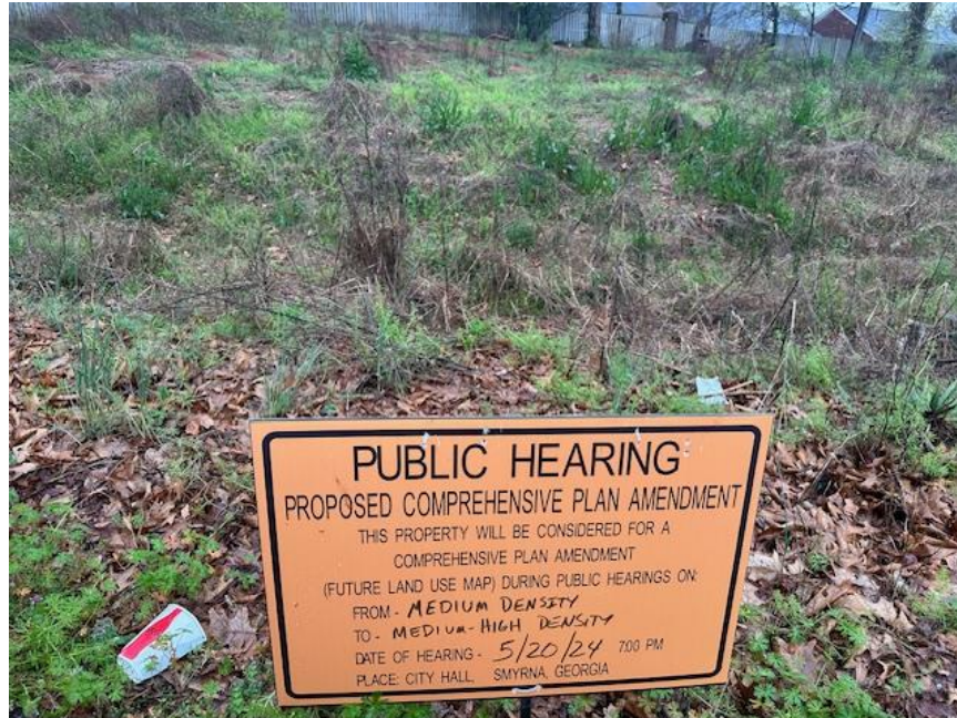
Figure 3 – Adjacent Property