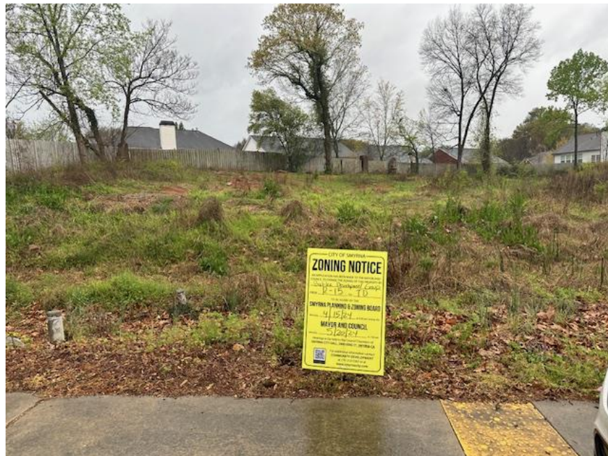
Figure 1 - Subject Property